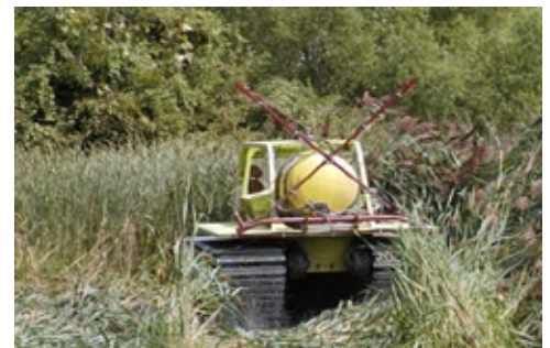
Ottawa NWR MarshMaster tramples invasive Phragmites stalks and opens up space for native species, getting a jump on impacts from a predicted drop in water levels in Lake Erie as a result of climate change.

The good news is that as we’ve thinned out these destructive plants and opened habitat, we’ve seen a resurgence in native species, including the reappearance of the endangered Eastern prairie fringed orchid. The Refuge population of the orchid is now one of the largest in the state of Ohio — a silver lining to the dark cloud posed by climate change.