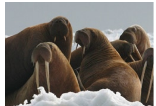
A group of walruses rest on seasonal pack ice in the Bering Sea.