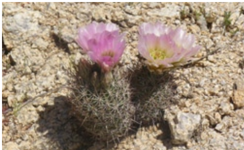
Acuna cactus in bloom.